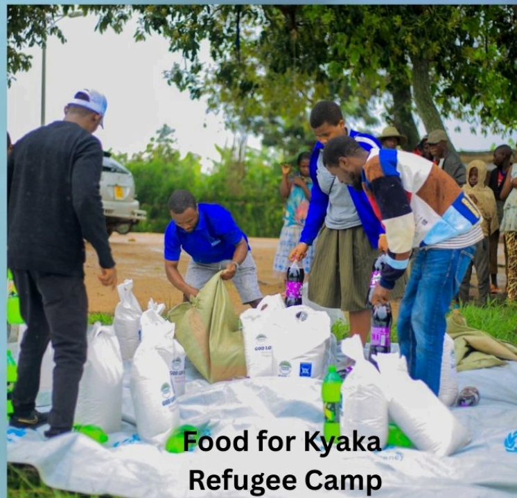
Food for Kyaka Refugee Camp